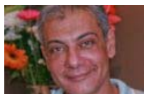
Second GTA physician no longer allowed to treat women