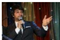
Q producer taking time off as CBC seeks 'clarity' around Jian Ghomeshi allegations