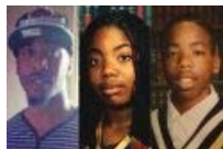
Mother speaks out against guns after third child gunned down