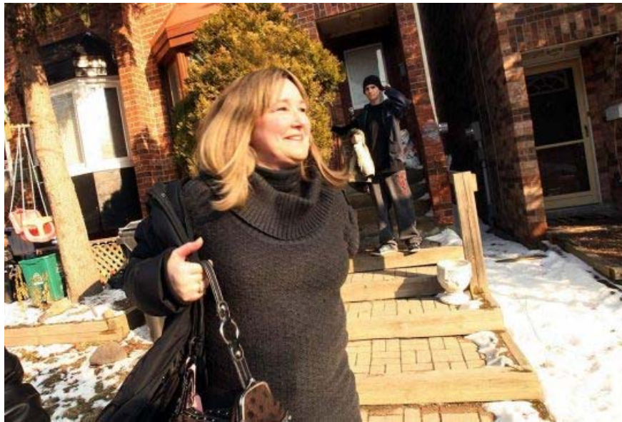
Order this photo