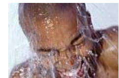
3 Surprising Benefits of Cold Showers Yellowpages