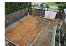
Photos: What This Guy Did With His Backyard is Hard to... Viral Nova