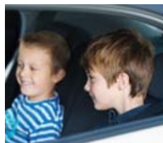
10 ways to make carpooling easier