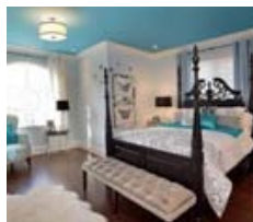
Working angles for maximum effect